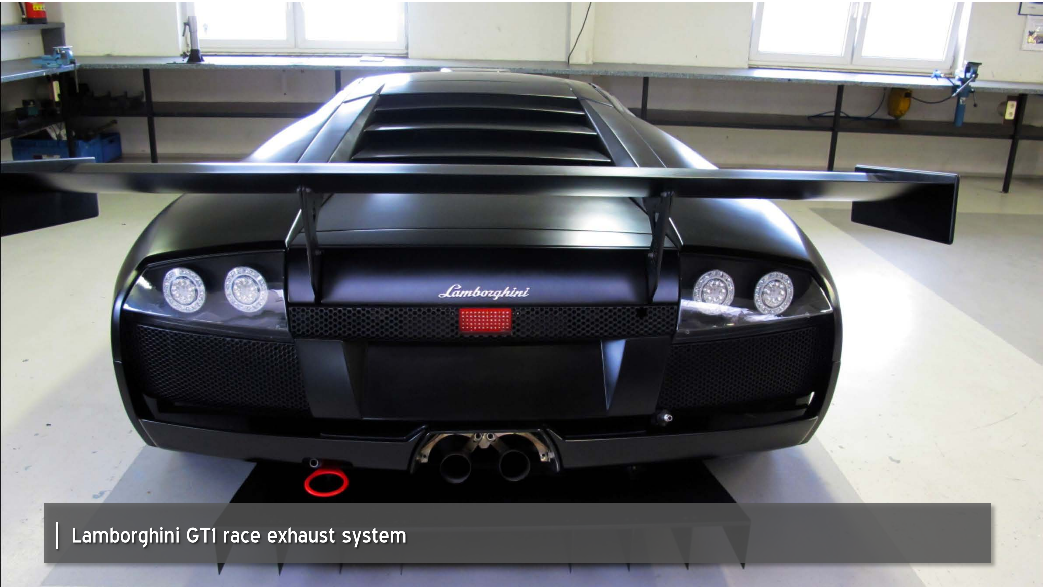
Lamborghini GT1 race exhaust system